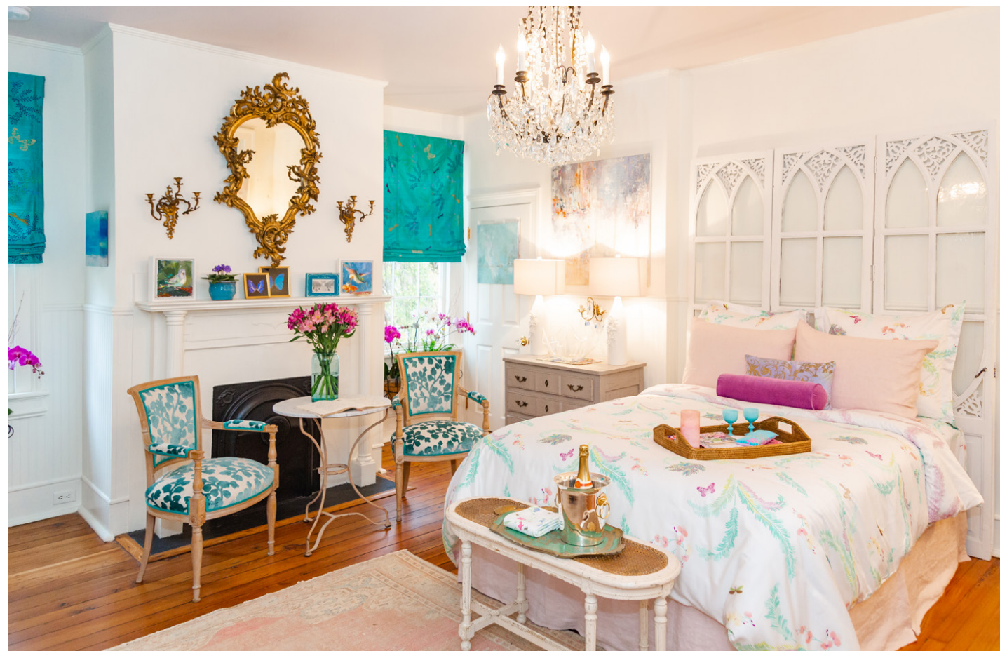
Photography by Kim Graham